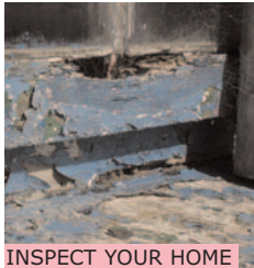
INSPECT YOUR HOME

PAINT Paint used before 1978 that is chipping or peeling may be a hazard. It is most risky at ages 9 months to 6 years when hand crawling and putting hands in mouth are most common. If you are